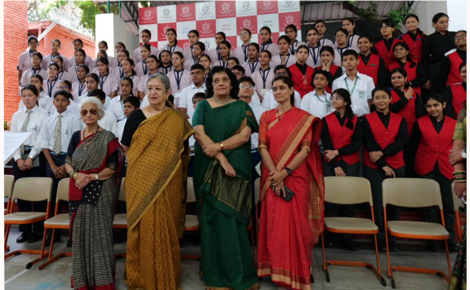
from Him Jyoti School, The Doon Girls' School, Dehradun Hills Academy, and DPS Vikasnagar participated in the workshop.